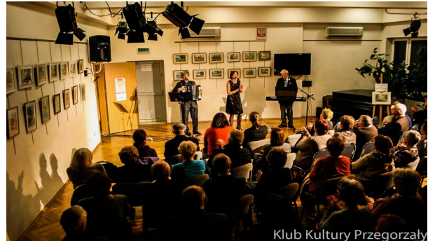
Klub Kultury Przegorzały

Cultural Club "Przegorzały" has extensive experience in international projects. Since 2012, we were involved in many international actions. Here are some examples: